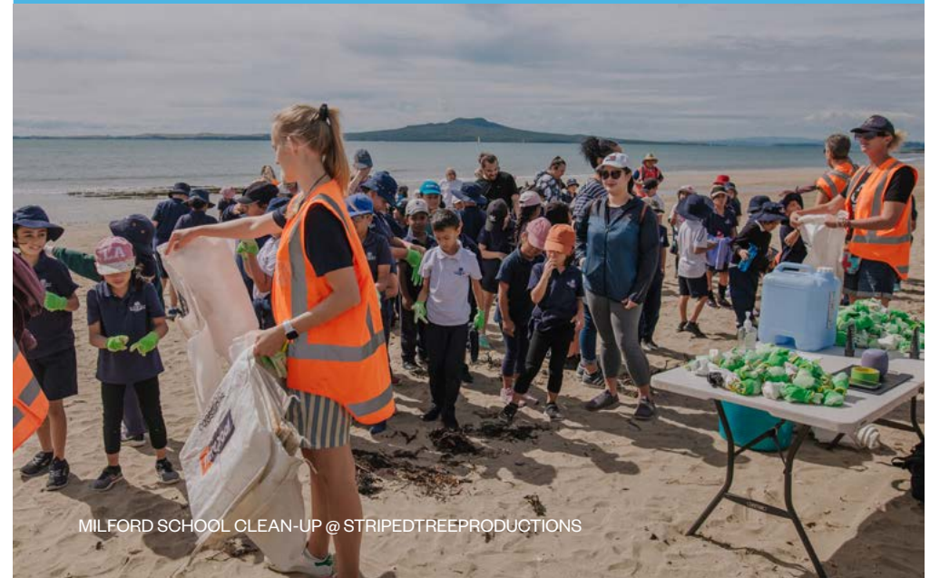
MILFORD SCHOOL CLEAN-UP