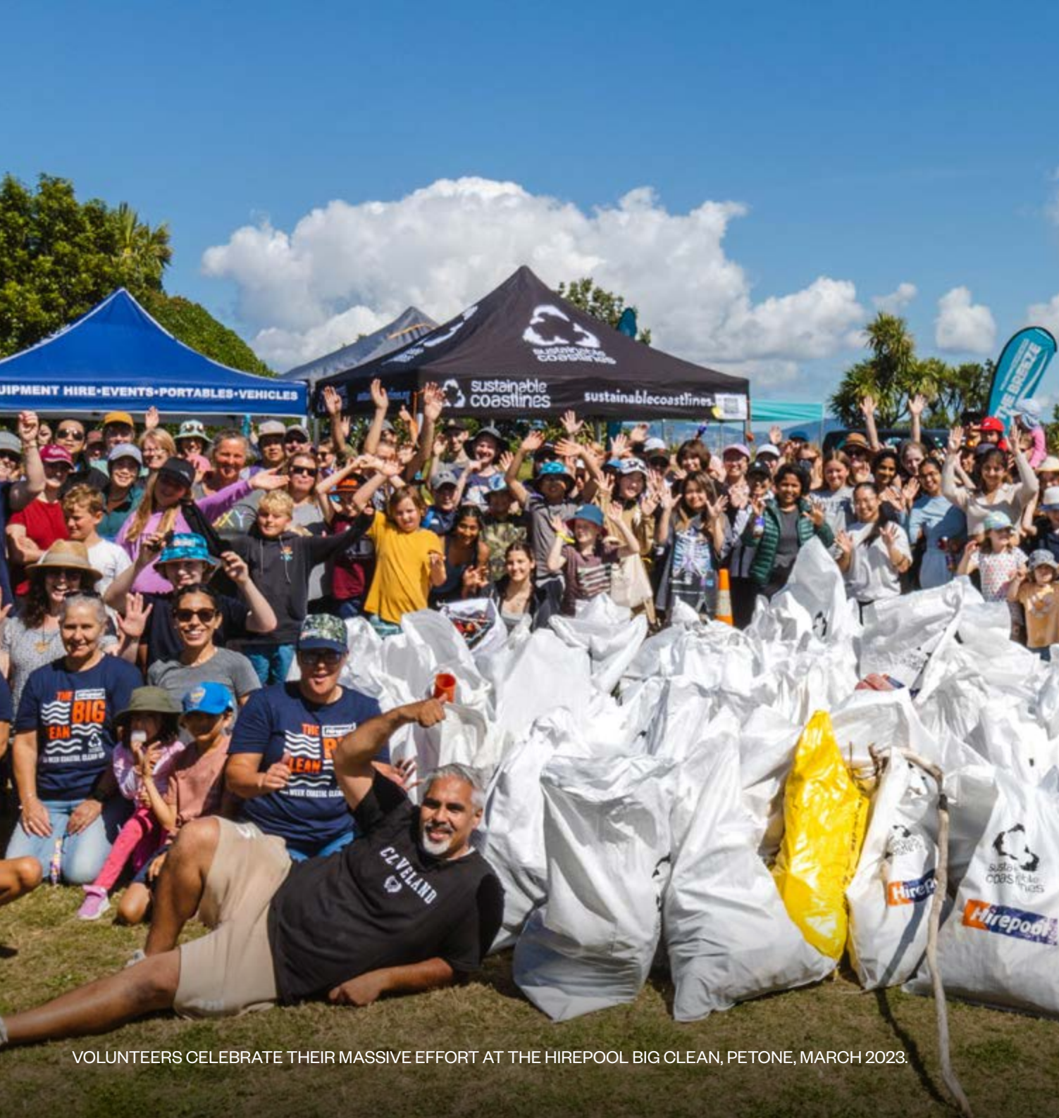
VOLUNTEERS CELEBRATE THEIR MASSIVE EFFORT AT THE HIREPOOL BIG CLEAN, PETONE, MARCH 2023.